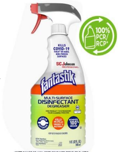
*BOTTLE MADE OF 100% POST-CONSUMER RECYCLED PLASTIC.