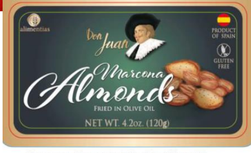
Marcona Almonds Fried in Olive Oil Ingredients: Marcona Almonds, Olive Oil and Salt. Contains: Almonds