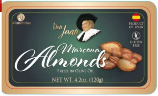
Marcona Almonds Fried in Olive Oil Ingredients: Marcona Almonds, Olive Oil and Salt. Contains: Almonds