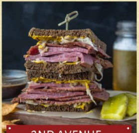
2ND AVENUE "RYE-CUT"

RAW CORNED BEEF BRISKET DELI TRIM CBI #10134154