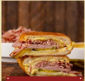
THE CUBAN REUBEN

Corned Beef, Pork Loin, Swiss Cheese, Pickles, Mustard on Pressed Cuban Bread