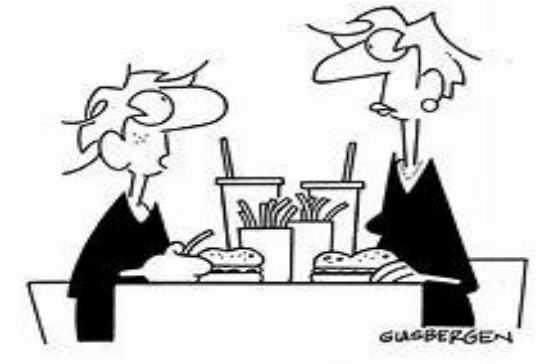
"Grandma says it's important to use the proper fork when you eat in a restaurant. What's a fork?"