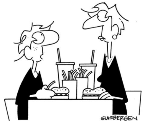
“Grandma says it's important to use the proper fork when you eat in a restaurant. What's a fork?”