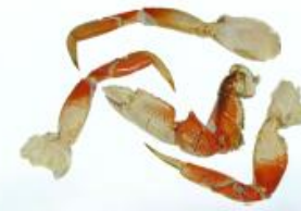
Snap 'n eat Legs & Claws