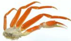
Clusters 5-8, 8-up, 10-up & 12-up