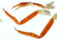
Snap n' Eat Pre-scored, claw on Pre-scored claw off